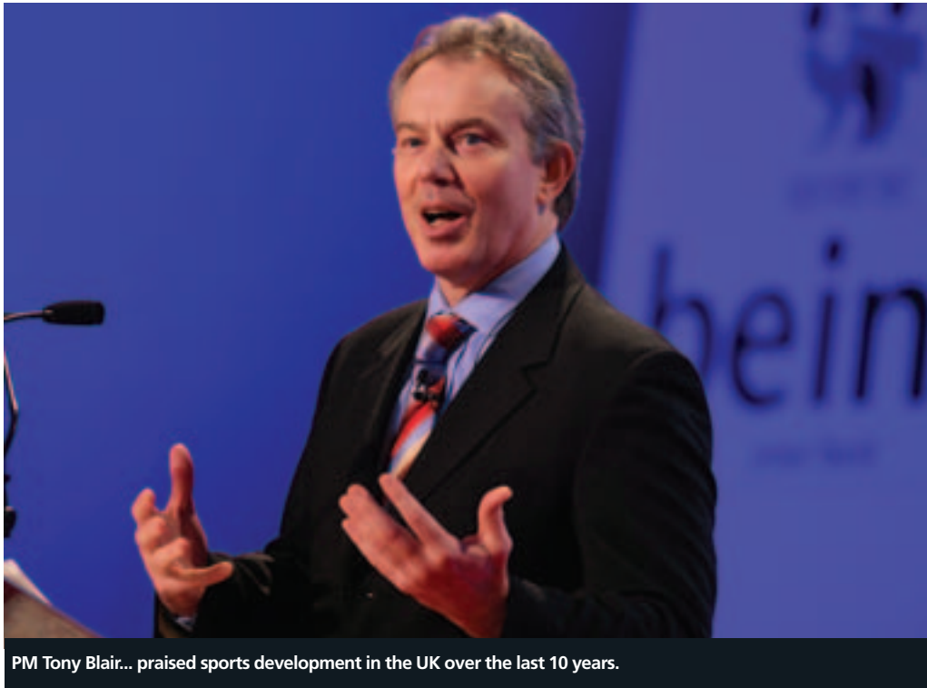
PM Tony Blair... praised sports development in the UK over the last 10 years.

Sports colleges, secondary schools which place PE and sport at the heart of the curriculum, play a key role in the national school sport strategy's prime objective – a joint Department for Education and Skills (DfES) and Department for Culture, Media and Sport (DCMS) target – to increase the numbers of young people taking part in school sport.